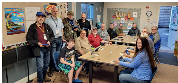
The SFARC VE Team making “new hams”

The SFARC Volunteer Exam (VE) Team offers in-person monthly amateur radio exam sessions at the Auburn California Crossroads Church campus and also during the annual summer ARRL Field Day. If you are a new ham, and looking for an Elmer (Mentor), SFARC has a great group of volunteers who will help you on your journey into amateur radio.