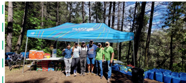
SFARC volunteers running a checkpoint station for the Canyons Endurance Runs

SFARC repeaters are used daily for special events, educational nets (on air gatherings), emergency communications, and just “rag chew” (conversation)