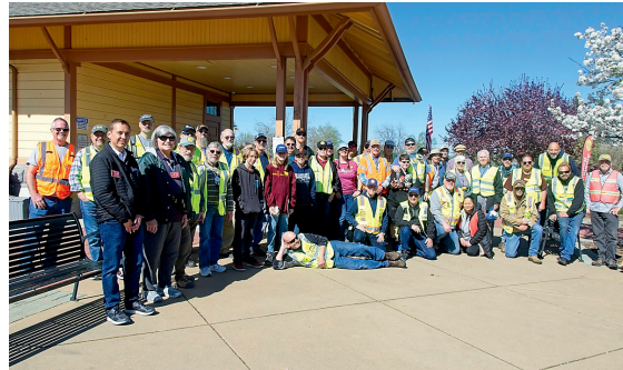
Crew of volunteers from SFARC's Hamfest 2024

We also support local community events such as local races, festivals, and other public outings.