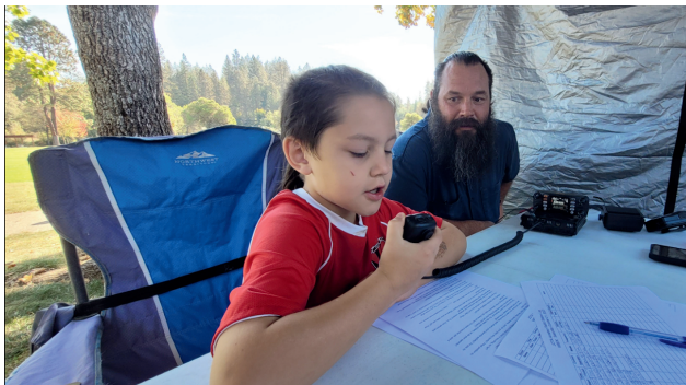
Ready to jump into the hobby? classes.w6ek.org

There’s nothing like making your first contact on amateur radio. Now is as good of a time as any to get your first license or an upgrade! SFARC has classes at all levels. Our classes are NOT a “cram session”! We focus on passing the test, but also teach the principles so you will understand the answers. Courses include (6) 2-hour online Zoom sessions plus (2) in-person labs. All are welcome and you don’t have to be local to participate