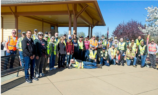
Crew of volunteers from SFARC's Hamfest 2024

We also support local community events such as local races, festivals, and other public outings.