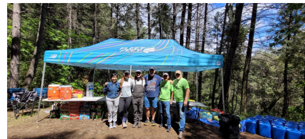
SFARC volunteers running a checkpoint station for the Canyons Endurance Runs

SFARC repeaters are used daily for special events, educational nets (on air gatherings), emergency communications, and just “rag chew” (conversation)