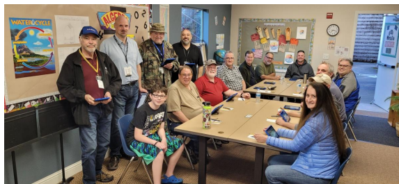
The SFARC VE Team making “new hams”

The SFARC Volunteer Exam (VE) Team offers in-person monthly amateur radio exam sessions at the Auburn California Crossroads Church campus and also during the annual summer ARRL Field Day. If you are a new ham, and looking for an Elmer (Mentor), SFARC has a great group of volunteers who will help you on your journey into amateur radio.