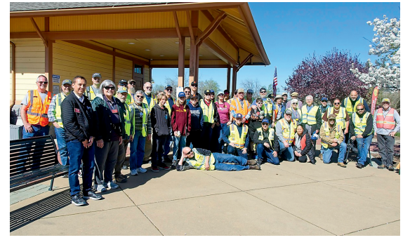
Crew of volunteers from SFARC's Hamfest 2024

We also support local community events such as local races, festivals, and other public outings.