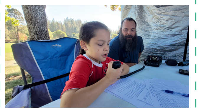
Ready to jump into the hobby? classes.w6ek.org SAFE ZONE

There's nothing like making your first contact on amateur radio. Now is as good of a time as any to get your first license or an upgrade! SFARC has classes at all levels. Our classes are NOT a "cram session"! We focus on passing the test, but also teach the principles so you will understand the answers. Courses include (6) 2-hour online Zoom sessions plus (2) in-person labs. All are welcome and you don't have to be local to participate